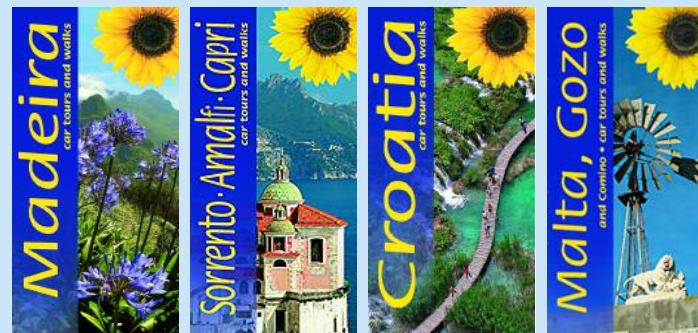
Four of the many destinations featured in the Landscapes series