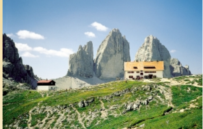
The Drei Zinnen Hut backed by the famous peaks