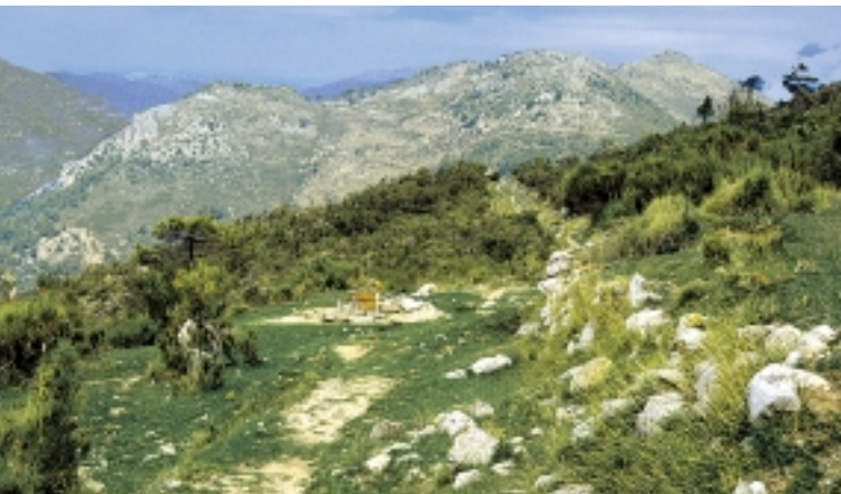
View north from the flanks of Mont Chauve d'Aspremont

From the fort retrace your steps to the GR5 (2h05min). Now follow it to the left along the Crête de Graus . A slight rise takes you up to a COL in about 35 minutes; ignore any minor or crossing paths, keep heading along the main path, towards a PYLON. The path descends to the ruined walls of the Château Reynard (2h55min) , from where there is another fine view. As the descent becomes more pronounced, you come to a T-junction: go left, towards another PYLON. At the pylon, ignore the yellow PR route straight ahead; go right on the GR, down towards a field. In the field, go left on a crossing path, into the olive groves and pines of a picnic area with tables ( Aire St-Michel; 3h12min ). On meeting a lane, follow it downhill past villas, to a BUS SHELTER on Avenue Jules Roman (3h20min) .