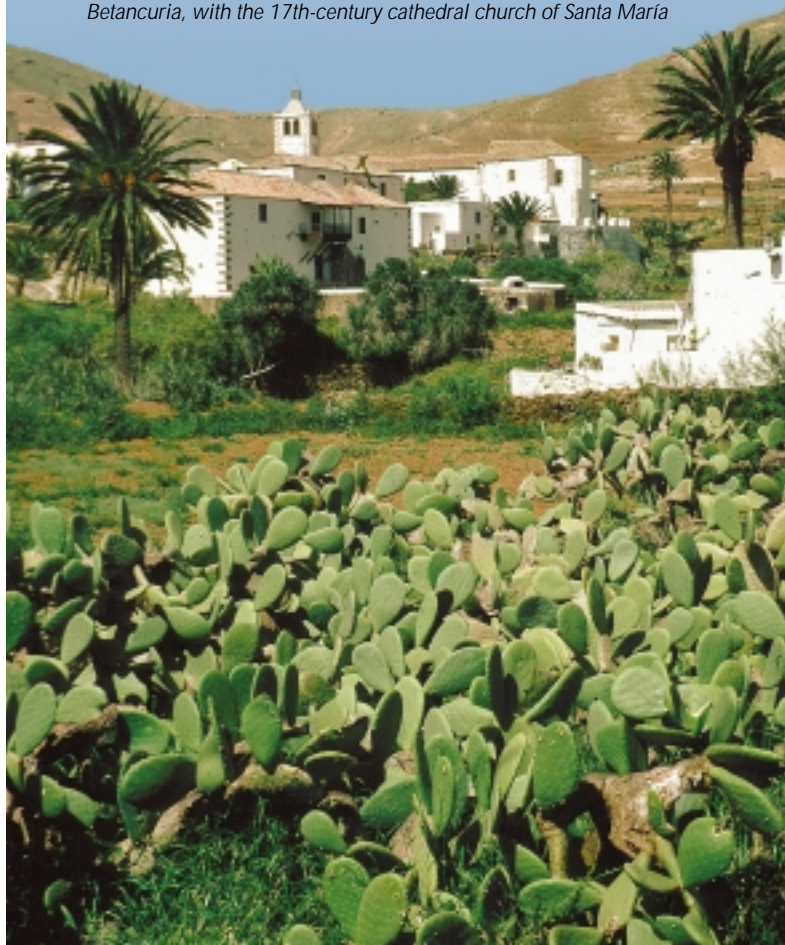
Betancuria, with the 17th-century cathedral church of Santa María

At the 1h20min mark we're crossing the Degollada de la Villa . On windy days brace yourself for a blasting! A brilliant sight awaits us now, as the vegetation changes completely. The inclines are dotted with wind-battered pines, and grass carpets the ground. Straight below us lies Betancuria, ensconced in these hills. Keeping straight over the crest, we descend on a very wide path. Thick leathery-leafed aloes border the path and nearby fields.