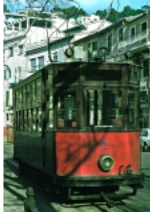
Sóller tram (above) and the lovely woodland path from Ca'n Puigserver

Then continue ahead, past the front of the house and down some ancient cobbled steps, from the top of which there is a lovely view