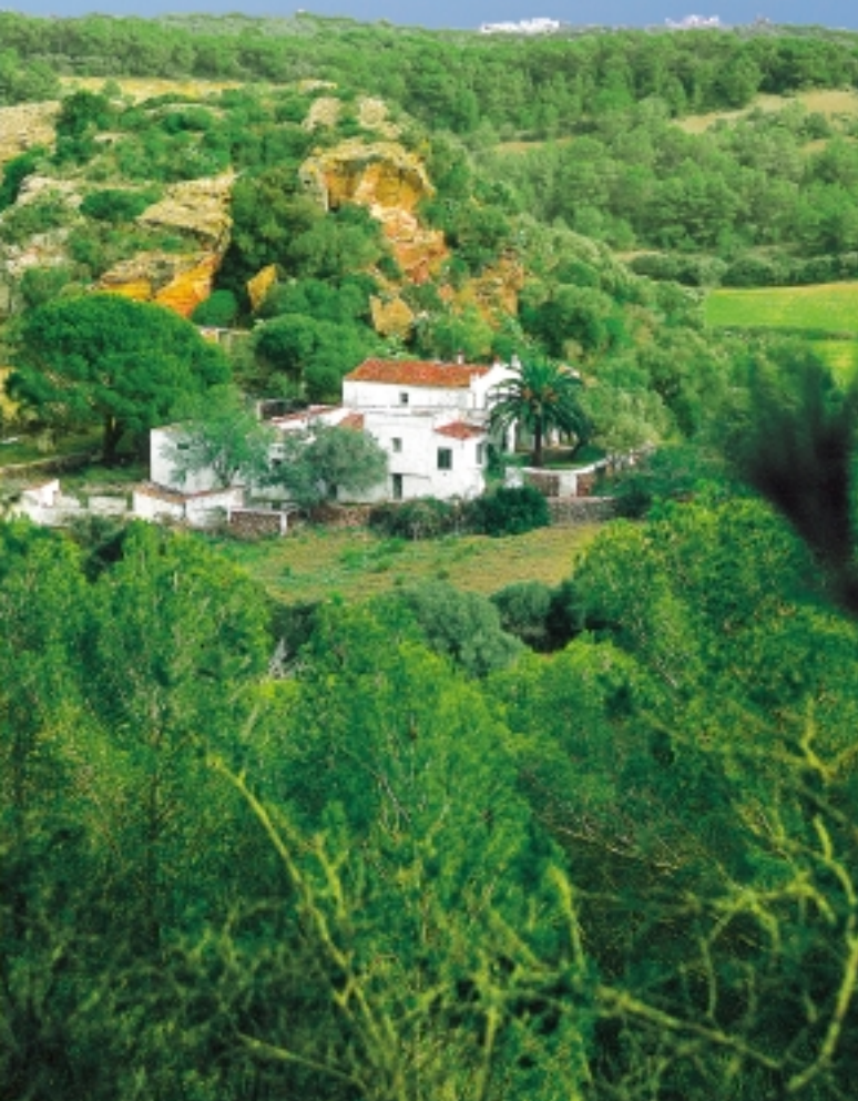
The Ejpte farmhouse in Es Custe d'Ejpte

Start Walk c at the church of Sant Llorenç and continue along the lane for five minutes, until you come to a crossroads beside the farm of BINIXEMS DE DEVANT .