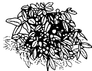
Right, from top to bottom, some Menorcan flora (see page 18): convolvulus, fig, olive, juniper and Pistacia lentiscus