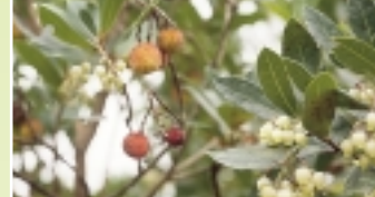
Strawberry tree ( Arbutus unedo )

A junction with a ROAD is reached in 50min . This is the new route to Pé do Frio, but the old route is more scenic, so cross the road and take the track to the right, descending parallel with the road. Stay right at the fork reached two minutes later, to enjoy good views across the valley to Pé do Frio. Where the track swings down left ( 54min ), keep ahead on a path, passing a small house up to the right. The field track/path descends,