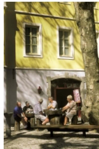
Caldas de Monchique; the village has recently undergone restoration.

that you are walking a horseshoe circuit around the valley down to your right. Pé do Frio and Chirão can both be seen below. Soon there is a fork in the track ( 2h41min ), where you keep up to the left. All along this section there are fine views down over old terraces and farm clusters. The track rises to join the ROAD (2h49min) . The PARKING PLACE where the walk began is just to the right ( 2h50min ).