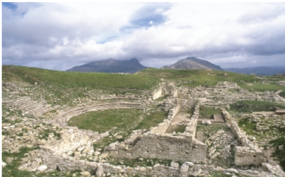
The ancient theatre on Monte Iato

You leave this trail (now marked as 'N° 3-PERCORSO DEI MILITI') and turn off left onto trail 'N° 4-SAN COSMO' ( 55min ). This narrow path — slippery in places — leads east below the plateau. It takes you past the Grotta del Tauro ( 1h05min ), which until recently served the shepherds as a shelter. The Kumeta and Pizzuta peaks appear in front of you now. Beyond a dilapidated WATERING PLACE you reach a rocky RIDGE ( 1h30min ), from where you look down on the ruins of the modest monastery and the wide valley of the Belice River. This is a pleasant place to take a short break. Then descend to the S. Cosmo MONASTERY RUINS and follow the cart track to the left, up the valley, until you can turn right on the concrete road, back down to your starting point at the ENTRANCE ( 1h50min ).