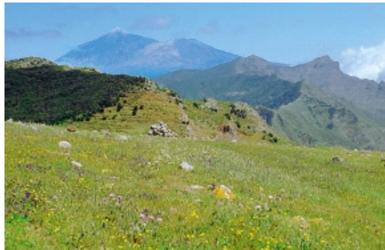
The hillside balcony not far outside La Siete (Picnic 19b).

Onward bound, head back down the track to the hamlet of La Siete , from where you follow a narrow tarred road in a short winding descent to Teno Alto (1h25min) . ( Those doing the Alternative walk should now use the map overleaf, to continue to La Montañeta: follow the route of Walk 20, but in reverse. ) The main walk leaves Teno on the road ascending to the left of Bar Los Bailaderos (signposting: 'PUERTO MALO'). The Buenavista flats reappear, down through a deep ravine. A few minutes along, just after a track forks off to the right, turn off on a wide dirt path (probably once a track) descending to the right. This steep descent brings you back to the road at a point where the road curves to the left and a track forks off it to the right. Cross the track and ascend the ridge ahead (signpost 'PUERTO MALO'). Your path soon swings