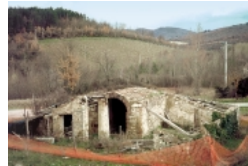
Top: old lime kiln for plaster for the walls inside Meleto Castle; bottom: looking towards the castle across typical Chianti vineyards

After a tour (see above) and perhaps a wine-tasting, follow the CAI 56 along the chapel wall. This track has wonderful views over the undulating Chianti country with its woodlands and vineyards. The track leads past a farm and